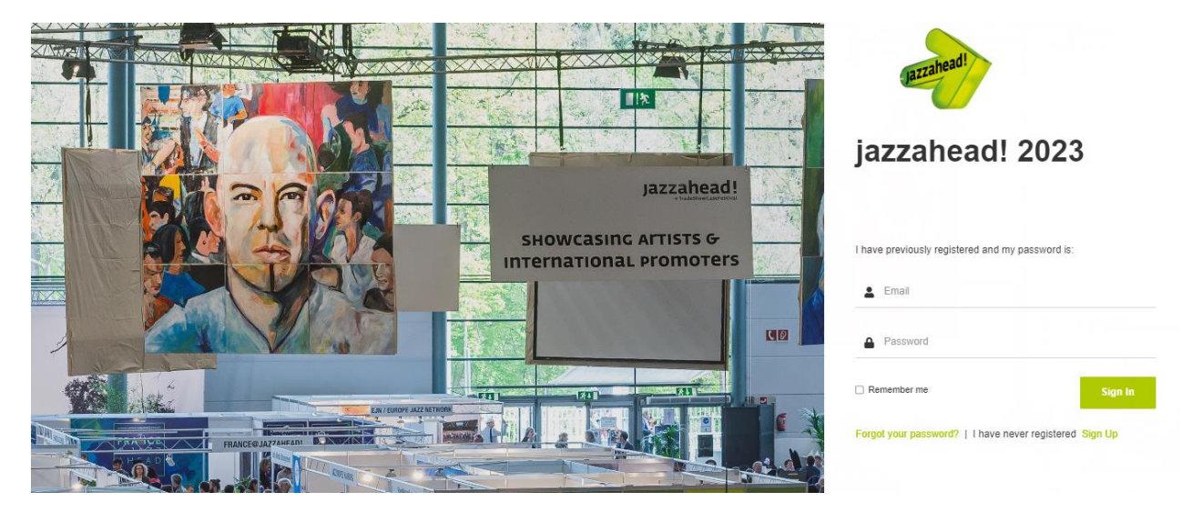
Please read the information on the first page carefully.

Access the Exhibitor Portal over our website with your already existing account or create a new account